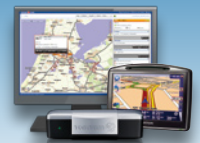
TomTom WORK Active